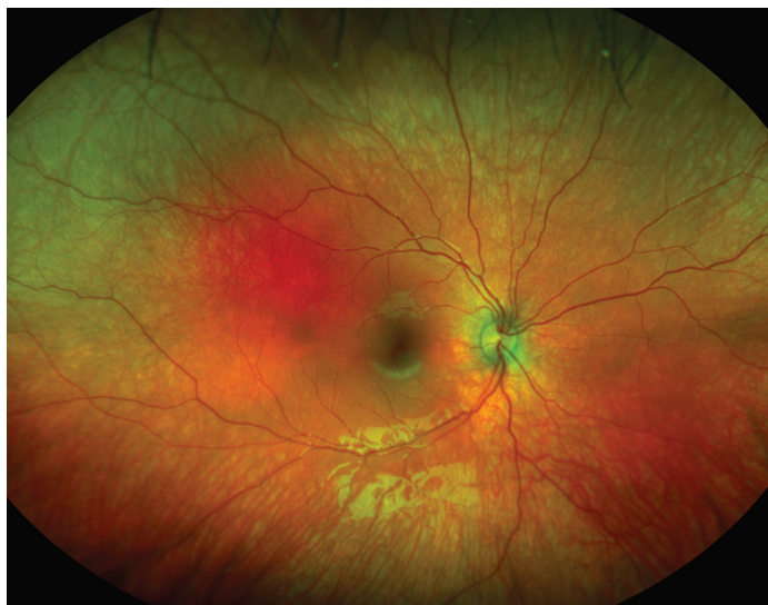
Healthy pediatric screening optomap